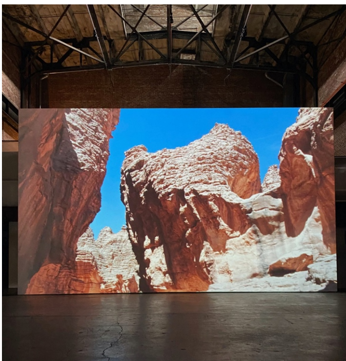
Installation view of Lydia Ourahmane: Tassili at SculptureCenter

Only two artworks comprise Lydia Ourahmane's Tassili at SculptureCenter in Long Island City, New York, yet the exhibition is far from small. Tassili is both the show's title and the name of the Algerian-British artist's 46-minute film, for which she traveled to the Tassili n'Ajjer plateau, in a remote desert between Algeria and Libya — a bureaucratic feat in the contentious region. The film is paired with a lustrous, black, high-relief topographical sculpture suspended from the ceiling of the spartan exhibition space. Together, the works pose complex questions about the historical and political significance of the artist's project.