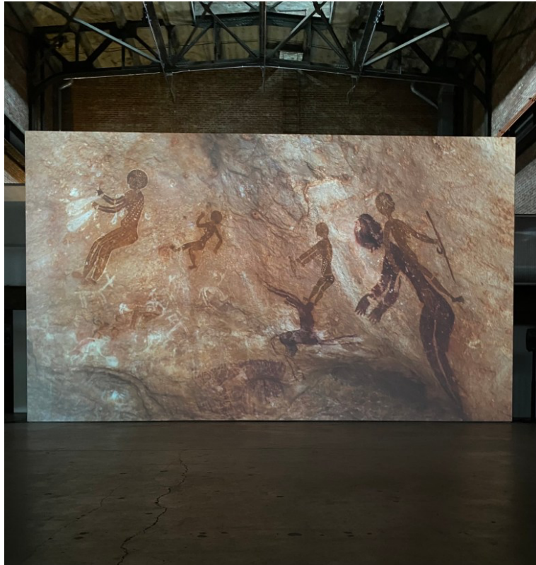
Installation view of Lydia Ourahmane: Tassili at SculptureCenter.

The music builds and drops to accompany breathtaking views. By dramatizing the imagery, the score questions whether or not the film sensationalizes an area fraught with issues of colonialism and displacement. An essay written for the exhibition addresses this directly and explains that visiting the plateau, which is not usually accepting of such professional filmmaking, requires local Tuareg people to serve as guides. Despite their crucial role at the government-protected site, the guides were born on the plateau and displaced by the Algerian government in the 1980s.